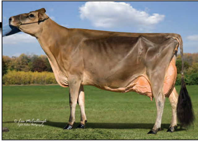
WF AXEL ROSITA, E-94% From the Same Family as Lot 42