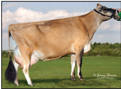
HARMONY CORNERS FREYNIE Fourth Dam of Lot 48