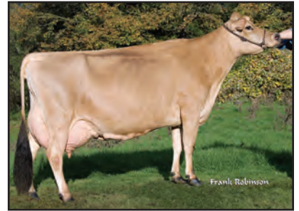
SUNSET CANYON LEMVIG MAID 4-ET, E-93% Seventh Dam of Lot 5