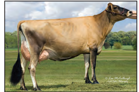
Sold in the 2008 sale HLF Excitation Evita, E-91% 2-9 305 3x 20,160 5.7% 1,141 3.6% 730