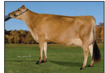
PINE-TREE LISTOWEL DELLA 1598-P-ET Sister to the Grandam of Lot 1