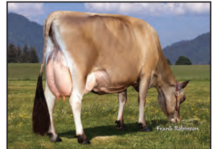
SUNSET CANYON IMPULS L MAID 4-ET, E-91% From the Same Family as Lot 11