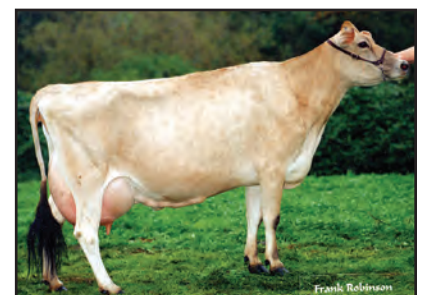
TENN HAUG E MAID, E-93% Eighth Dam of Lot 1