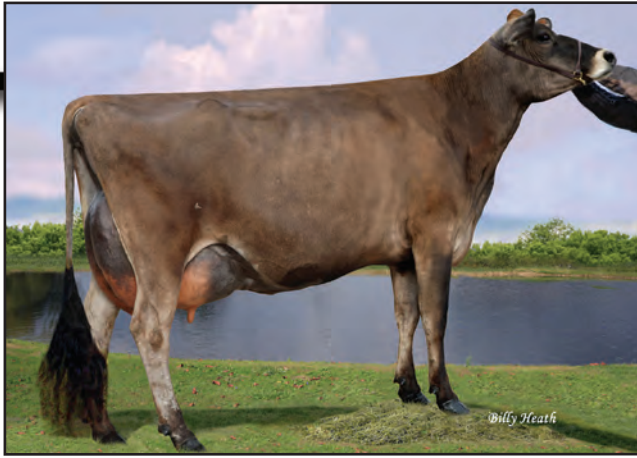
SVHEATH HIRED GUN SUGAR, E-92% Great-Grandam of Lot 37