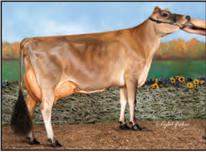
GLENVIEW IATOLA FELICIA Grandam of Lot 28