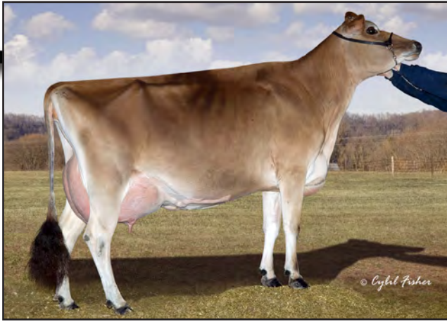
PIEDMONT DUKE CANDY, E-94% Sixth Dam of Lot 9