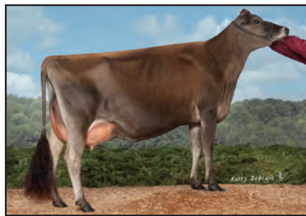
Sold in the 2010 sale Cooper Farm RBR Miss America-ET, E-91% 2 nd 4-year-old, 2013 Southern National Jersey Show