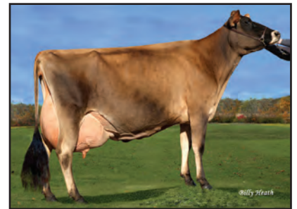
STONEY POINT VINDICATION FEEBEE-ET Sister to the Grandam of Lot 51