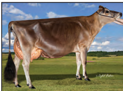
SOUTH MOUNTAIN VOLTAGE RADIANT-ET Sister to the Dam of Lot 30

TATTOO /A1797 DHIA HERD # 35-57-0960 CONTROL # 1797 1-10 305 3 19240 4.7 910 3.5 671 96DCR 2319C 2-11 305 2 21890 4.9 1071 3.7 799 98DCR 2763C 3-11 305 2 25380 4.7 1190 3.7 928 98DCR 3190C 5-02 305 2 23550 4.6 1083 3.5 828 98DCR 2862C 305 2X ME AVG 4L 25365M 1174F 895P 3087C PPA 2296M 105F 88P / YD 1144M 53F 54P CDCB GPTA S 05/04/2021 4RECS 86%R 81%ILE 79M 0.00% 4F 0.04% 11P 192CM$ 177NM$ 145FM$ 4.1PL 0.9LIV -0.1DPR 0.4CCR -1.3HCR 2.95SCS 137GM$ 0.0MFV 0.3DAB 1.0KET -0.4MAS 0.4MET -0.1RPL 1.99HTI AJCA 05/04/2021 GPTAT 83%R 0.4 GJUI 4.4 GJPI 81%R 51