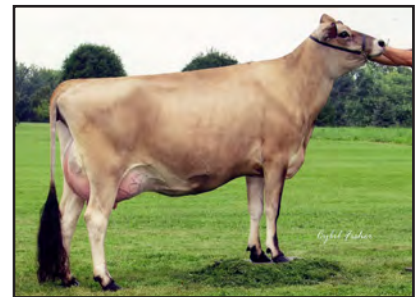
SPRING VALLEY JUDE JETTA Fourth Dam of Lot 49

SISTER(S): KLINEDELL INCENTIVE JACEY 91% 3-07 305 2 15360 4.4 679 3.4 529 97DCR 1818C