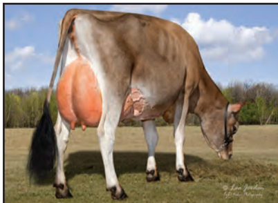
ELLIOTTS CHAVEZ RENEE-ET Sister to the Dam of Lot 30

2018 HM ALL AMERICAN PRODUCE OF DAM RES. GRAND CHAMPION, 2014 INTERNATIONAL JERSEY SHOW GRAND CHAMPION, 2017 MARYLAND STATE FAIR GRAND CHAMPION, 2017 NEW YORK SPRING SHOW RESERVE SENIOR CHAMPION, 2015 MID-ATLANTIC REGIONAL RESERVE GRAND CHAMPION, 2015 NEW YORK SPRING SHOW GRAND CHAMPION, 2014 MARYLAND STATE FAIR INTERMEDIATE CHAMPION, 2013 MID-ATLANTIC REGIONAL NOMINATED ABA ALL AMERICAN AGED COW, 2017 RESERVE ABA ALL AMERICAN AGED COW, 2016 HON. MENTION ABA ALL AMERICAN AGED COW, 2016 INTERMEDIATE CHAMPION, 2012 INTERNATIONAL JERSEY SHOW SIRE: BRIDON EXCITATION GJPI -125 1%ILE