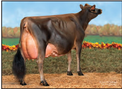
HARMONY CORNERS FOZZY-ET Great-Grandam of Lot 48