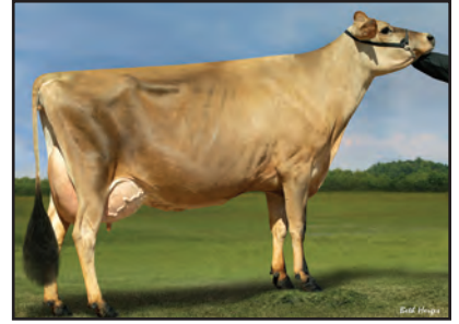
OAKLANE CHISEL DELLA 2130-ET Great-Grandam of Lot 5