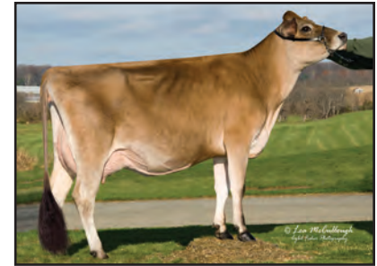
HERMITAGE COUNCILLER SHEYBA-ETN Sister to the Grandam of Lot 39