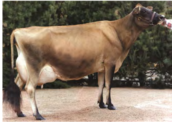
BUTTERFIELD REWARD POLLYANNA, E-95% FIFTH DAM OF LOT 101A