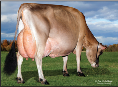
MISS SAMBO BLACK GOLD, E-95% From the Same Family as Lot 4

Supreme Champion, 1999 PA All-American Res. National Grand Champion, 2001 National Grand Champion & Res. Supreme, 2002 World Dairy Expo Grand Champion, 2002 All American Eighth Dam of Lot 4