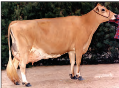
C TOPS IMPRESSIVE Great-Grandam of Lot 32