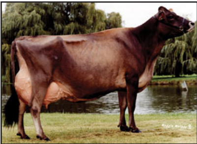
BLACKY ROSE OF BRIARCLIFFS, E-96%

WF STANDOUT BLACKKEYEDPEAS 91% 3-03 305 2 17290 5.2 902 3.7 639 98DCR 2210C