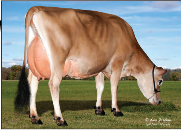
SCENIC VIEW MESCHACH MAID-P-ET, E-90% Great-Grandam of Lot 11