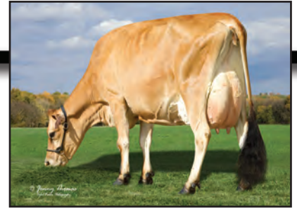
SUNSET CANYON NAVARA LV MAID 4-ET Fourth Dam of Lot 11