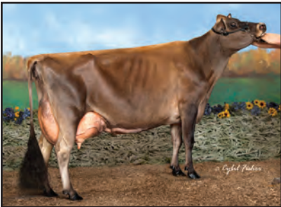
GLENVIEW COMERICA FRANNIE Sister to the Grandam of Lot 28