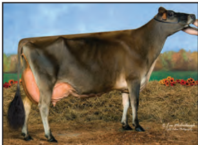
RATLIFF PRICE ALICIA Great-Grandam of Lot 16