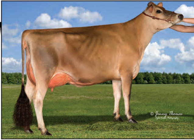
GORDONS METALICA OLIVIA, E-90% Grandam of Lot 25