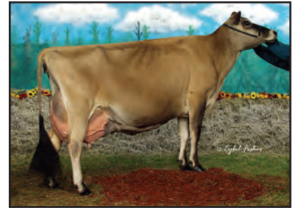
EDGEVIEW RENAISSANCE JANE 57, E-96% Fifth Dam of Lot 49