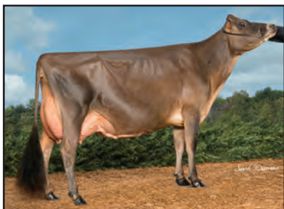
RATLIFF SAMBO ALISON-ET Sister to the Grandam of Lot 16