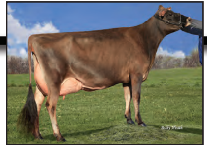
STONEY POINT VINDICATON FALINE Dam of Lot 51

4TH DAM: SHF GRANDE FANTASIA 92% 6-00 365 2 20059 5.2 1050 3.5 703 DHIR 2430C RESERVE GRAND CHAMPION, 2001 NY STATE FAIR JR SHOW 1ST 5-YEAR-OLD, 2001 NY STATE FAIR JUNIOR SHOW