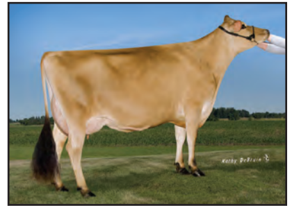
JX PINE-TREE WORLD CUP DELLA {5}-ET Sister to the Grandam of Lot 5