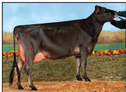
WF BARBARO ASLEEP Sister to the Grandam of Lot 38

BORN 05/04/2019 PO FEMALE EFI 5.8% AMERICAN ID 6192/6192