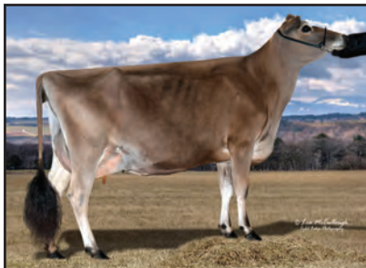
WOODMOHR INDIANA ROSEBUD Great-Grandam of Lot 30

JX KASH-IN SHOOTOUT {5}-P-ET JE840003013871581 GT13K BBR 100 JH1F JNSF A1A2 91JE5624 CDCB GPTA S 04/01/2021 200DAUS 27HRDS 2%RIP 97%R -537M 0.20% 15F 27%ILE 97%R 0.08% -4P 137CM$ 114NM$ 65FM$ 90GM$ 0.8PL -1.6LIV -1.1DPR -1.2CCR 2.6HCR 2.81SCS 0.1MFV 0.4DAB 0.1KET 0.6MAS 1.2MET -0.1RPL 4.34HTI AJCA 04/01/2021 64DAUS GPTAT 93%R 1.2 GJUI 13.2 GJPI 92%R 28