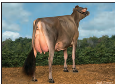
RATLIFF APPLE JACK ANSLEY-ET Sister to the Grandam of Lot 16