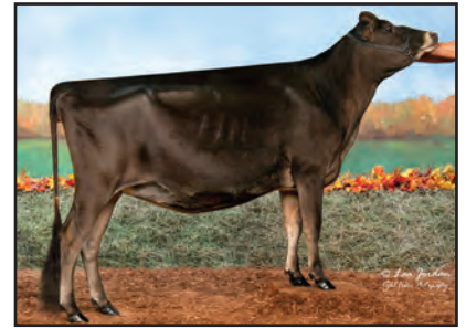
J-KAY FIZZ PUNKY Dam of Lot 27