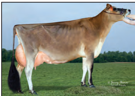
Sold in the 2009 sale Marhaven Justice Sugar-ET, E-91% Intermediate Champ, 2009 Mid-Atlantic Regional Jr.