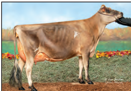
Sold in the 2014 sale Arethusa Excitation Jojo-ET, E-94% 2nd Sr. 3-yr.-old, 2017 Western National