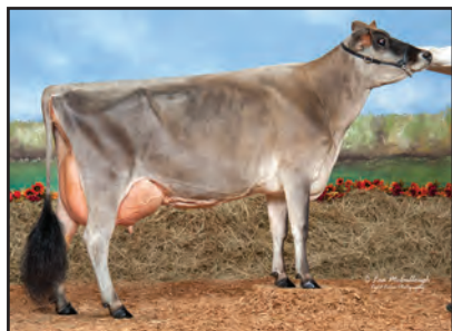
WF CENTURION ANABELLA-ET Great-Grandam of Lot 38