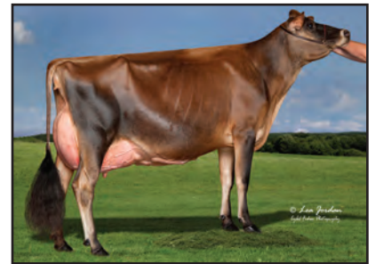
STONEY POINT BELMONT FASHION Sister to Lot 51