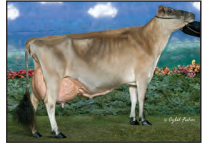
HERMITAGE COUNCILLER SHEBA Grandam of Lot 39

4TH DAM: HERMITAGE IMPERIAL SHELLEY VG 86 (CAN) 4-00 305 2 12207 5.8 710 4.2 516 CAN 1788C