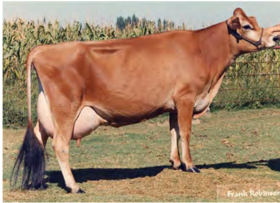
WILDERNESS KENT ZERO, VG-85% FROM THE SAME FAMILY AS LOT 106A