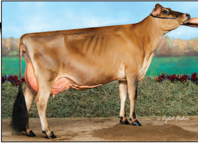
GENESIS VELOCITY JITTER, E-93% Sister to Grandam Lot 19