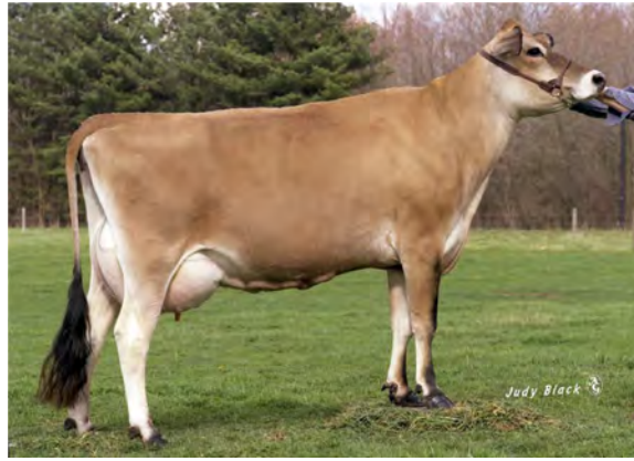
WESLEYS BROOK SIERRA SWAN, E-94% FROM THE SAME FAMILY AS LOT 104I