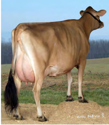
IMPULS ZAP ZELENA OF VAN DE, VG-88% FIFTH DAM OF LOT 105E