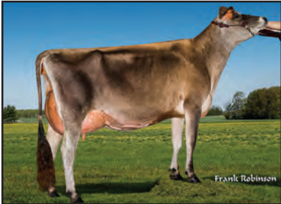
M-SIGNATURE VALENTINO SOPHIE-ETS Sister to the Grandam of Lot 2