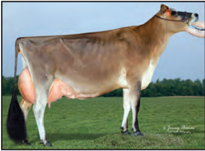
MARHAVEN JUSTICE SUGAR-ET Great-Grandam of Lot 2

SISTER(S): M-SIGNATURE VALENTINO SOPHIE-ETS RESERVE INTERMEDIATE CHAMPION, MICHIGAN SPRING SHOW 2ND SENIOR 2 YEAR OLD, 2015 MICHIGAN SPRING SHOW 2ND PLACE INTERMEDIATE YEARLING, 2014 MI DAIRY EXPO M-SIGNATURE FIERY SEPHORA 82% 3-04 305 3 22660 4.2 945 3.5 798 93DCR 2618C