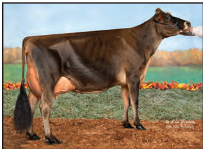
J-KAY EXCITATION FUZZY Sister to the Grandam of Lot 48