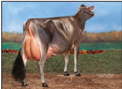
RATLIFF ACTION ANGEL Sister to the Grandam of Lot 16