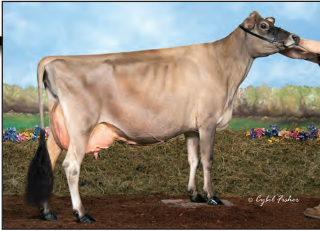
COOPER FARM D EARL JOCELYN {6}, E-90% Fourth Dam of Lot 3