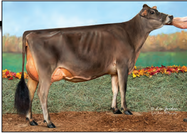
DKG TEQUILA LILAC, E-90% Sister to the Dam of Lot 36