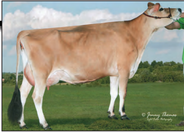
HARMONY-CORNERS LIBBY, E-93% Fourth Dam of Lot 12