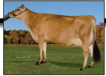
PINE-TREE LISTOWEL DELLA 1598-P-ET Grandam of Lot 5

4TH DAM: SUNSET CANYON DZZLER V MAID 2348 90% 6-01 305 2 24500 6.2 1521 4.1 1008 100DCR 3491C