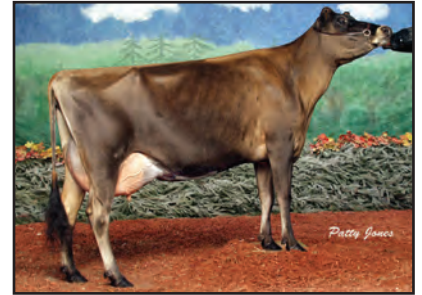
ROSALEA RENS SYBIL, EX 93-5E (CAN) Fifth Dam of Lot 37

4TH DAM: C-YELLOW BRIAR NEVADA SYBIL 90% 8-10 302 2 13890 5.0 688 3.7 509 97DCR 1760C