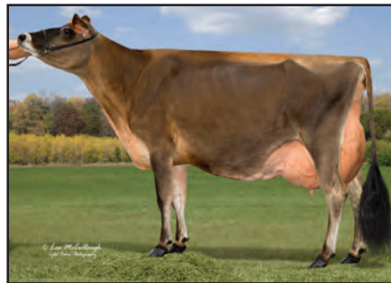
Sold in the 2005 sale Green Views Furor Jessica, E-94% Grand Champion, 2009 Ohio State Fair