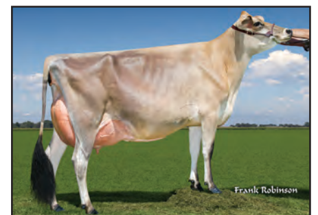
Sold in the 2011 sale Maple Ridge Nevada Pearl II, E-93% Reserve Intermediate Champ, 2013 CA Spring Show