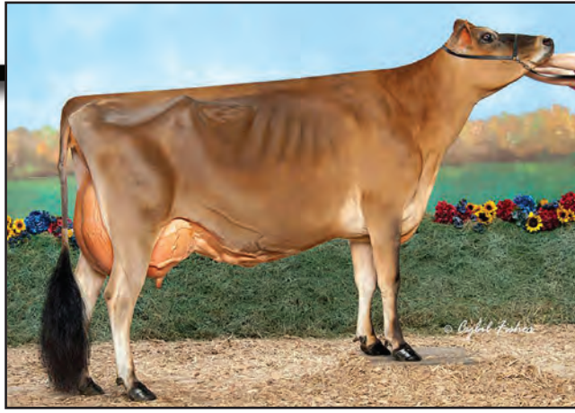
M-SIGNATURE VALENTINO SCARLETT-ET, E-94% Grandam of Lot 2