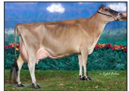
IATOLA SHEONA OF WF Sister to the Dam of Lot 39