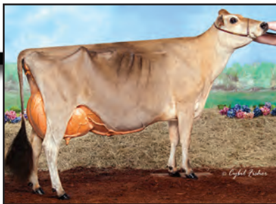
MARYNOLE EXCITE ROSEY Grandam of Lot 30