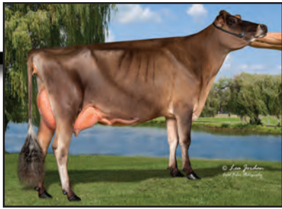
J-KAY MADE YOU LOOK FANCY Dam of Lot 48