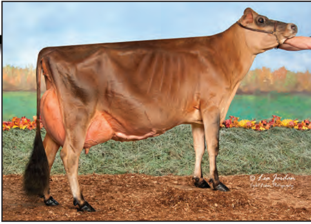
MA BROWN VITALITY RAQUETTE, E-93% Dam of Lot 13