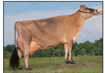
STONEY POINT VINDICATION FIFI Sister to the Grandam of Lot 51