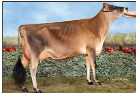
Sold in the 2012 sale Maple Ridge G Prix Jasmine, E-93% Reserve Intermediate Champ, 2012 Eastern States