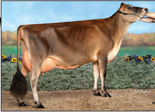
STEESSHANIE IATOLA TINKERBELL Great-Grandam of Lot 23