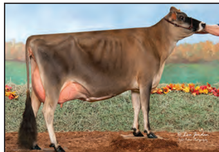
Sold in the 2015 sale Cloverfield Goldhammer Grace, E-91% Reserve Intermediate Champ, 2017 IN State Fair