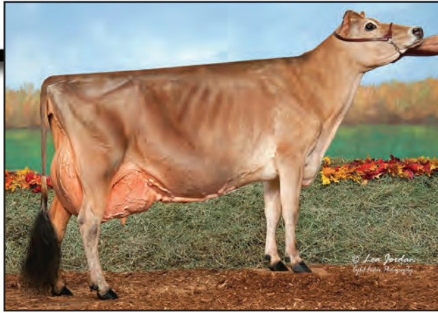
XANADU GILLER ALBET, E-94% Grandam of Lot 40