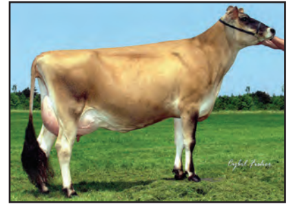
SHF SAMBO FUCHSIA Great-Grandam of Lot 51