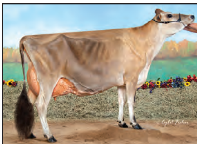
ELLIOTTS CHAVEZ ROXIE-ET Sister to the Dam of Lot 30

ELLIOTT'S EXCITING ROSABEL-ET 86% 2-02 302 2 18640 4.3 795 3.5 652 96DCR 2175C ELLIOTT'S RISING STAR-ET 80% 4-01 305 2 16690 4.3 726 3.6 598 97DCR 1990C ROSEBUDS INCENTIVE RIGHTEOUS-ET 87% 3-01 305 2 15370 4.5 685 3.4 530 96DCR 1829C ROSEBUDS HIRED GUN RODEO-ET 88% 3-03 305 2 15160 5.2 786 3.4 523 97DCR 1807C