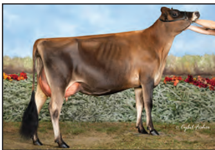
Sold in the 2011 sale Hixson Indiana Ilene, E-92% Reserve Junior All American Jr. 2-yr.-old, 2012