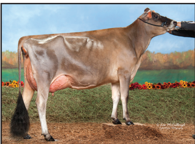
WF SUREFIRE BOUQUET, E-91% From the Same Family as Lot 4