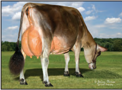
EXCITATION IRISH Dam of Lot 32