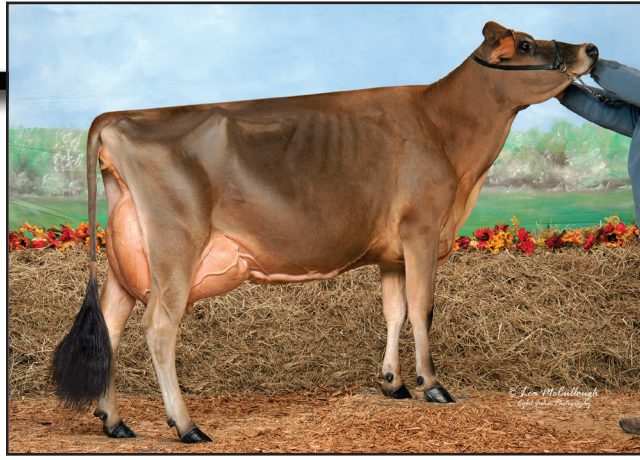
MISS IATOLA BLACKIE ROSE-ET, E-93% National Jersey Jug Winner, 2011 Fifth Dam of Lot 4