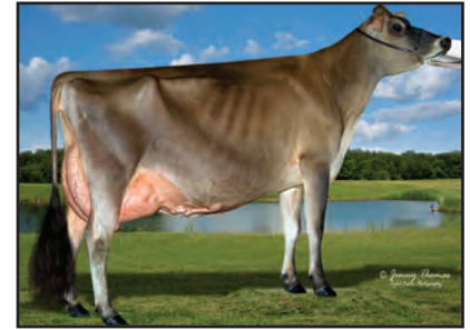
LLR PREMIER TOO LEGIT-ET Sister to the Grandam of Lot 23

4TH DAM: SHADY LANE WHISTLER TISH-ET EX 90 (CAN) 2-00 305 2 6913 4.8 335 3.9 269 CAN 910C