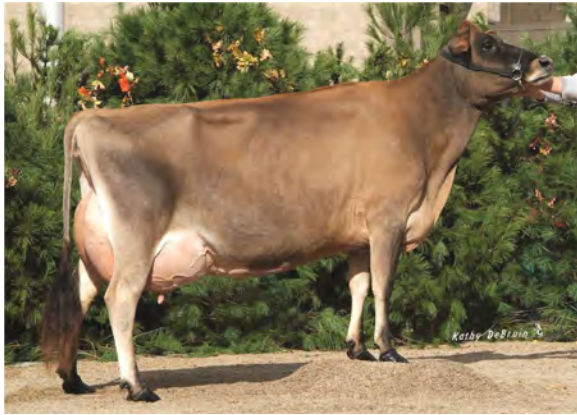
BUTTERFIELD PARISEANNE-ET, E-92% FOURTH DAM OF LOT 101A