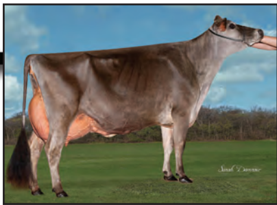
RATLIFF IMPRESSION ANNABELLA-ET Grandam of Lot 16