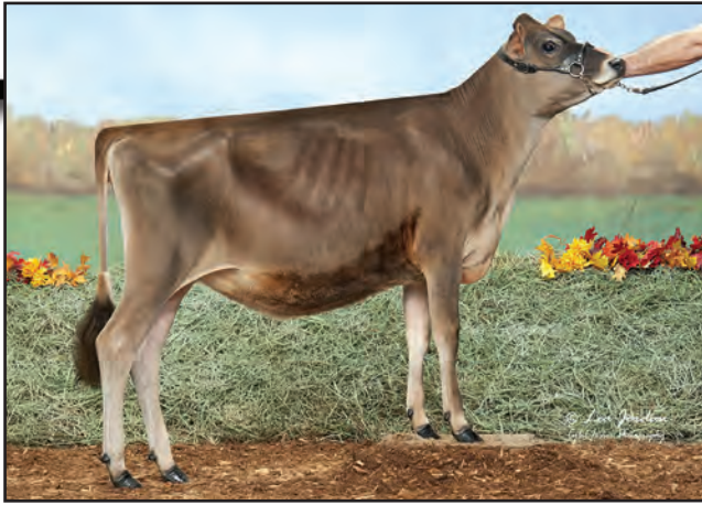
CORNISH VOLCANO LINDY STAR Dam of Lot 21