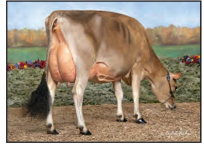
KLINEDELL IATOLA JASMINE Sister to the Grandam of Lot 49

JPI 42%R -116 ST SR DF RA RW RL FA FU 0.5 1.0 0.4 H1.4 1.5 P1.0 50.9 1.2 RH RUW UC UD TP TL RTR RTS -0.5 -0.1 0.5 S0.0 C1.6 L1.0 C1.4 C0.2