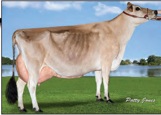
TANBARK DUaiseoir FAVOUR, SUP-EX 92-6E (CAN) Sister to the Grandam of Lot 47