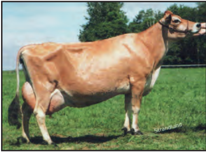
FAMILY HILL BROOK LYNNA, E-94% Sixth Dam of Lot 12