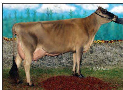
GIPRAT RENN ANASTASIA-ET Fourth Dam of Lot 38