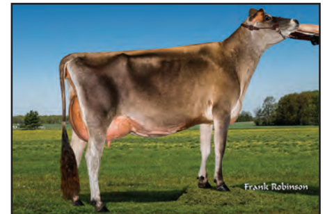
Sold in the 2014 sale M-Signature Valentino Sophie-ETS 1st Sr. 2-yr.-old, 2015 Michigan Dairy Expo