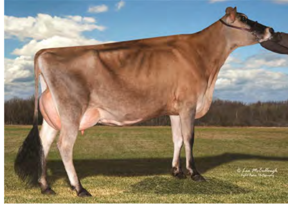
VAN DE ZUMA ZSA ZSA ZASU, E-90% FROM THE SAME FAMILY AS LOT 105E