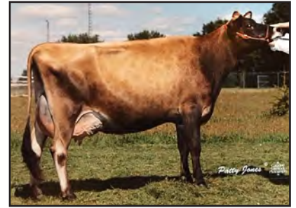
VALLEYSTREAM JUNO JESS, EX (CAN) Seventh Dam of Lot 19

4TH DAM: GENESIS BREAKAWAY HONALULU EX 90 (CAN) 3-05 305 2 17944 4.5 811 3.9 706 CAN 2281C SILVER AWARD, JULY 2010