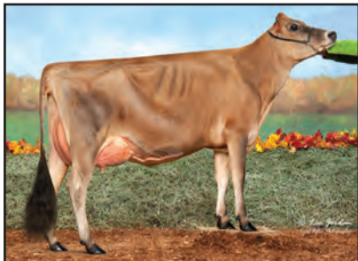
J-KAY APPLEJACK FREYNIE-ET Sister to the Grandam of Lot 48