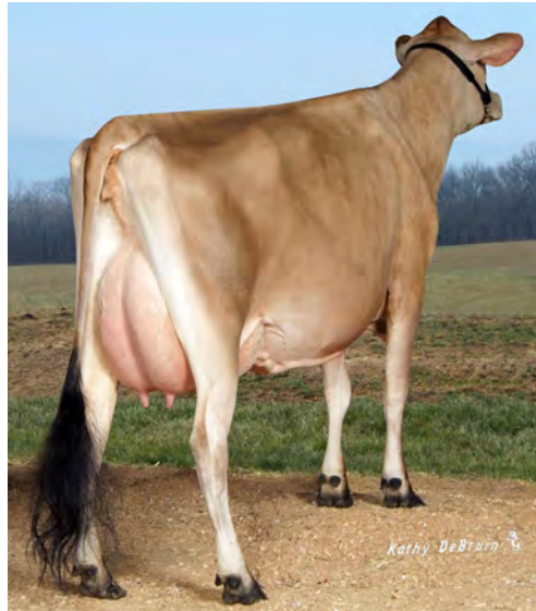
VAN DE IMPULS HYACINTH, E-92% FOURTH DAM OF LOT 105H