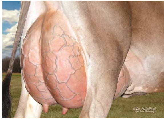
VAN DE KYROS FLAMENCO GYPSY, VG-86% GRANDAM OF LOT 106H