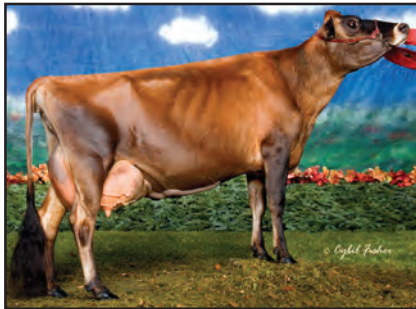
Sold in the 2003 sale Smart Remake Enchantment, E-93% Supreme Champ., 2005 World Dairy Expo Jr. Show

Celebrating a long history of selling the great ones. These are just a few of the well-known girls that have crossed the auction block in this annual spring sale.