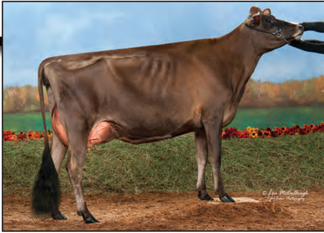
ARAGORN PAT A CAKE, E-95% Grandam of Lot 27