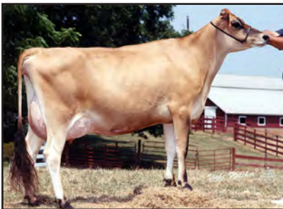
WILLIAMS IMPRESSIVE IDEA, E-90% From the Same Family as Lot 32 Dam of "latola"

BORN 07/21/2019 TATTOO /K47 PO FEMALE EFI 4.1%