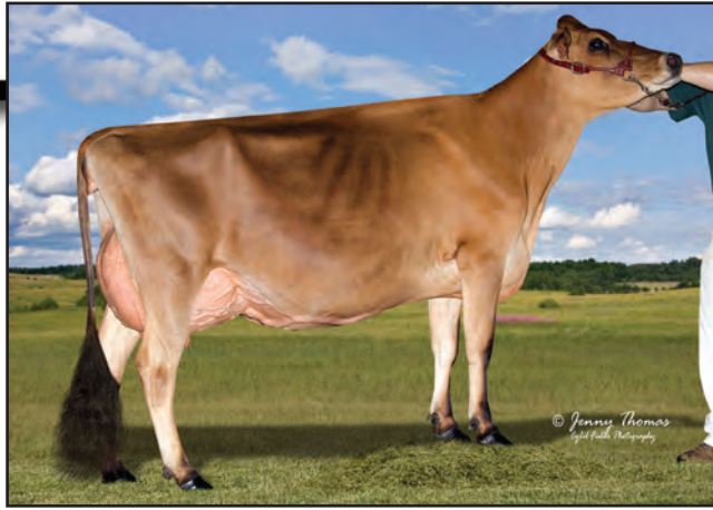
GORDONS COMERICA CHOCOLATE, E-91% Great-Grandam of Lot 22