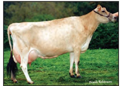
TENN HAUG E MAID, E-93% Eighth Dam of Lot 5