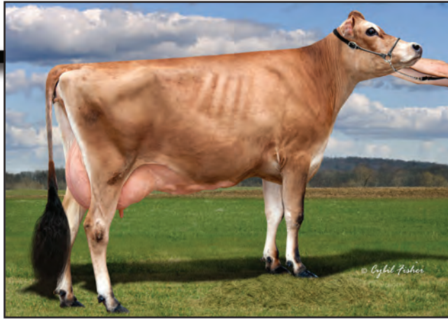
WETUMPKA MAGNUM JULIANNE-P, E-90% Grandam of Lot 6