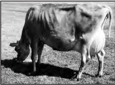
VALHALLA SPARKLER LOLLY Fourth Dam of Lot 50

4TH DAM: VALHALLA SPARKLER LOLLY 91% 8-06 305 2 14540 5.3 776 3.4 495 94DCR 1710C