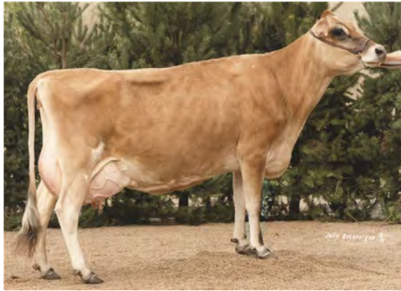
HIGHLAND JODYS TB JESSIE, E-92% NATIONAL GRAND CHAMPION, 1994 FROM THE SAME FAMILY AS LOT 100A