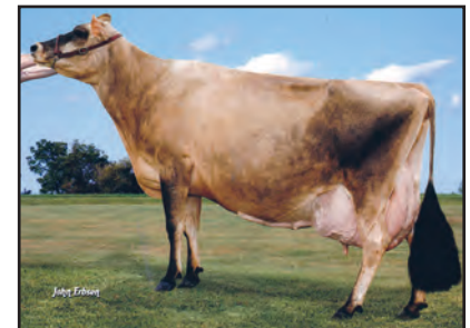
SUNSET CANYON CENTURION L MAID 2-ET, E-94% From the Same Family as Lot 11