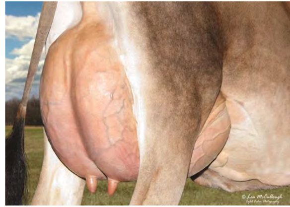
VAN DE ZUMA ZINGER ZAIRE, VG-85% FROM THE SAME FAMILY AS LOT 106E